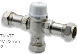
TMV 15mm TMVIT-MC101 or TMV 22mm TMVITMC102

For more information, visit cistermiser.co.uk/category/tmv