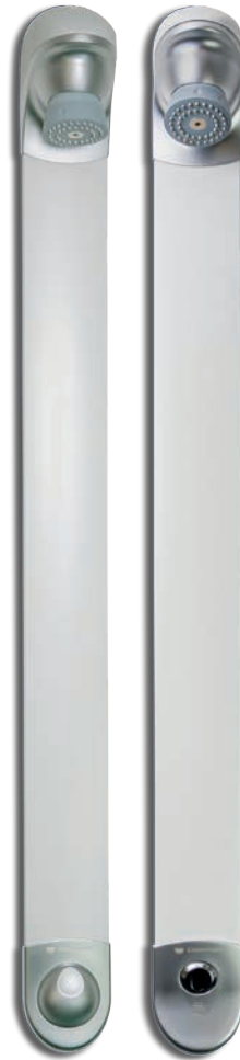
Vecta+ Sensor Shower Panel - SSPV Hygienic non-touch sensor configuration