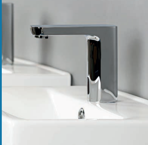
Vecta+ Sensor Tap

For more information, visit cistermiser.co.uk/category/infrared-taps